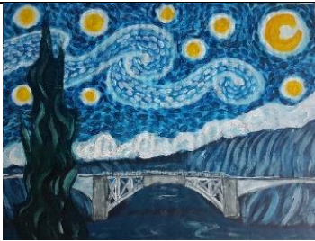
"Starry Night in Launceston"