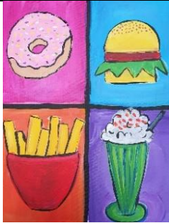
"Pop Art food"