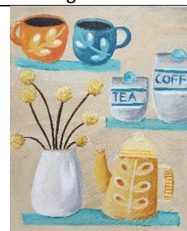
"Teapot and cups"