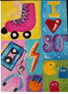
"I love the 80's"

A little harder: The paintings below are still achievable and lots of fun too