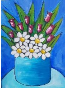
"Roses and Daises"