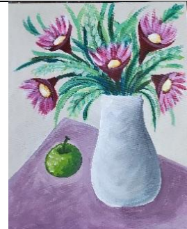
"Apple and flowers"