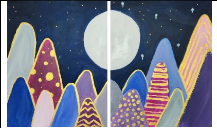
"Colourful Mountains" Can be done as a partner painting or individually