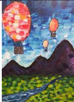
"Hot Air Ballons"