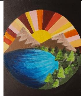
"Mountains and Sun"